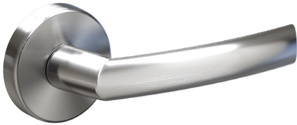
Stella ● SCP