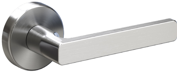
Rivera ● ABC ● MB ● SCP