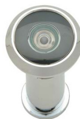
Door viewer ● MB ● SCP