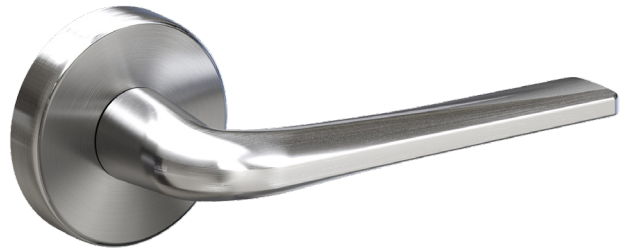
Sierra ● ABC ● MB ● SCP