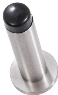
Wall mounted door stop* ● ABC ● MB ● SSS