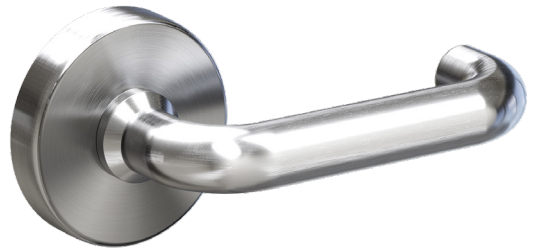
Centra ● SCP