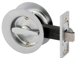
Cavity slider ● ABC ● MB ● SCP